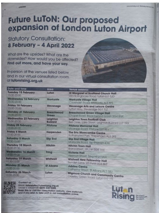
Figure K5.4 Newspaper advertisement on Luton Airport extension consultation events (whole page)