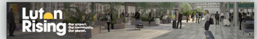
Mobile leaderboard 320 x 50px